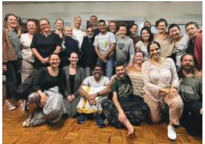
A.I.A.S 2020 cohort