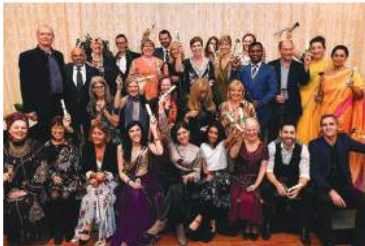
A.I.A.S Ayurveda Graduates The 2014 Cohort