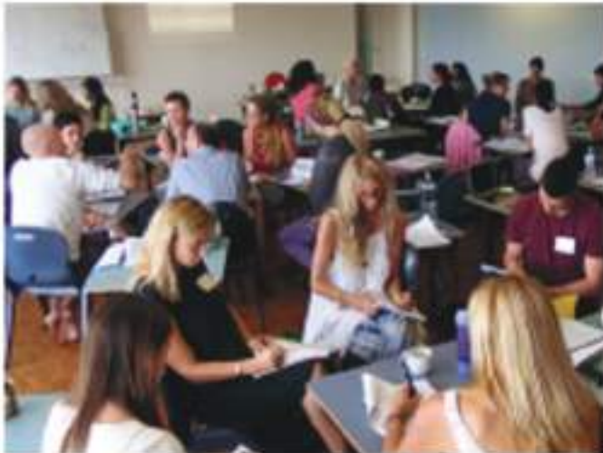
A.I.A.S 2014 cohort - another impressive group