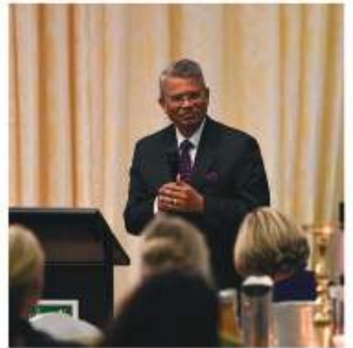
India High Commissioner, The Honourable Dr. Gondane addresses A.I.A.S Students