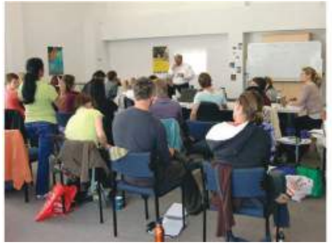
The 2011 A.I.A.S Ayurveda cohort